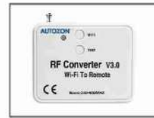
AZ RF WIFI 31A Wifi Module