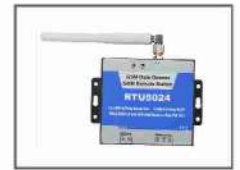
AZ GSM 30 GSM Module