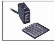
AZ RFPC 417M IP Reflector Photocell